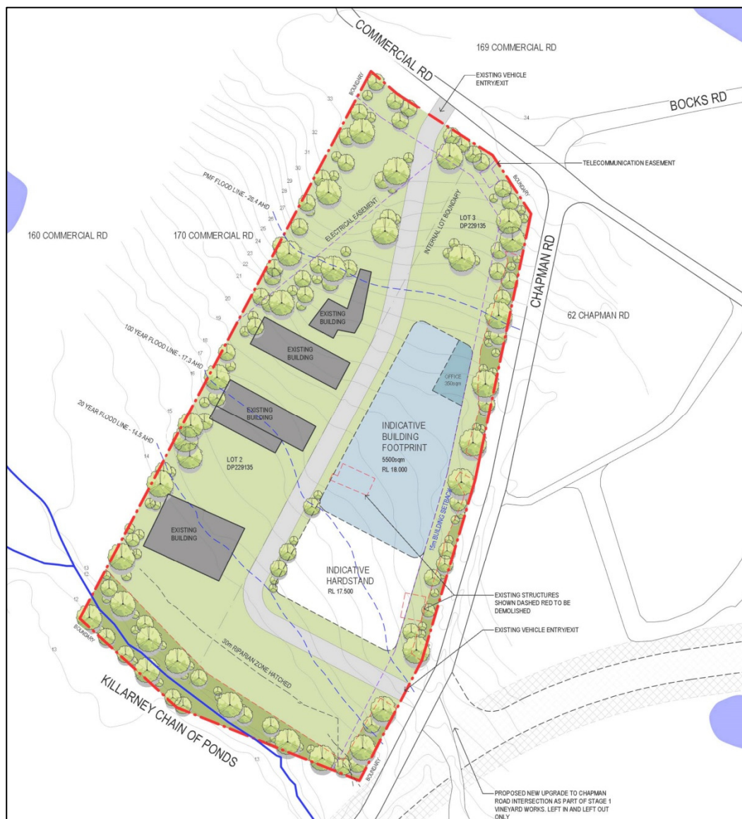
Figure 4 Indicative development plan

The final access arrangements, including details of new/modified driveway crossovers, will be detailed as part of a future Development Application for the site.