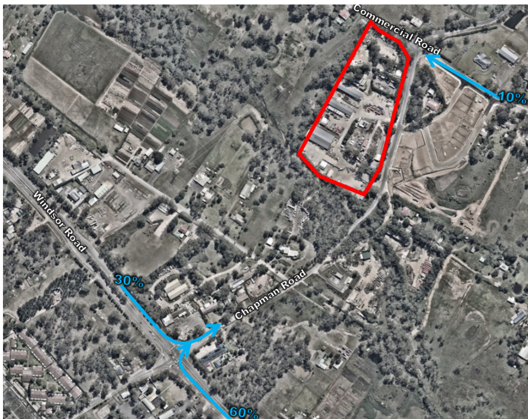
Figure 5 Forecast traffic distribution

Based on current traffic flows the majority of traffic is expected to arrive to the site from Windsor Road given its status as a classified State Road. The majority of traffic would access the site via the Windsor Road / Chapman Road signalised intersection as indicated in Figure 5 below and travel towards the Chapman Road / Commercial Road intersection. A small proportion of traffic is projected to access the site via Commercial Road.