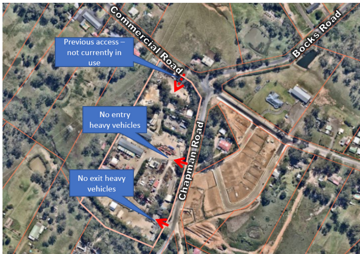
Figure 3 Current site access arrangements

The southern driveway facilitates the entry of heavy vehicles into the site, with the northern driveway providing for exit movements back onto Chapman Road.