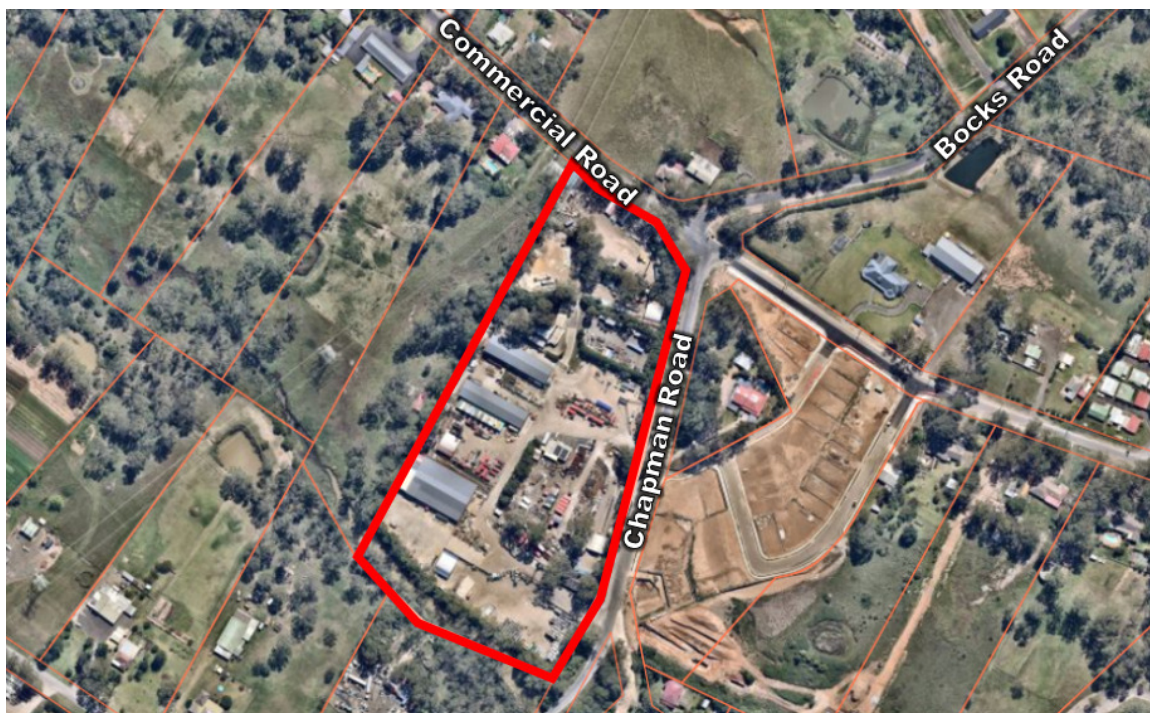
Figure 1 Site location

The site is approximately 4.2 hectares and has direct frontage to two roads – Commercial and Chapman Roads. Vineyard train station is located approximately 1.5km (less than a 5 minute drive) away from the site.